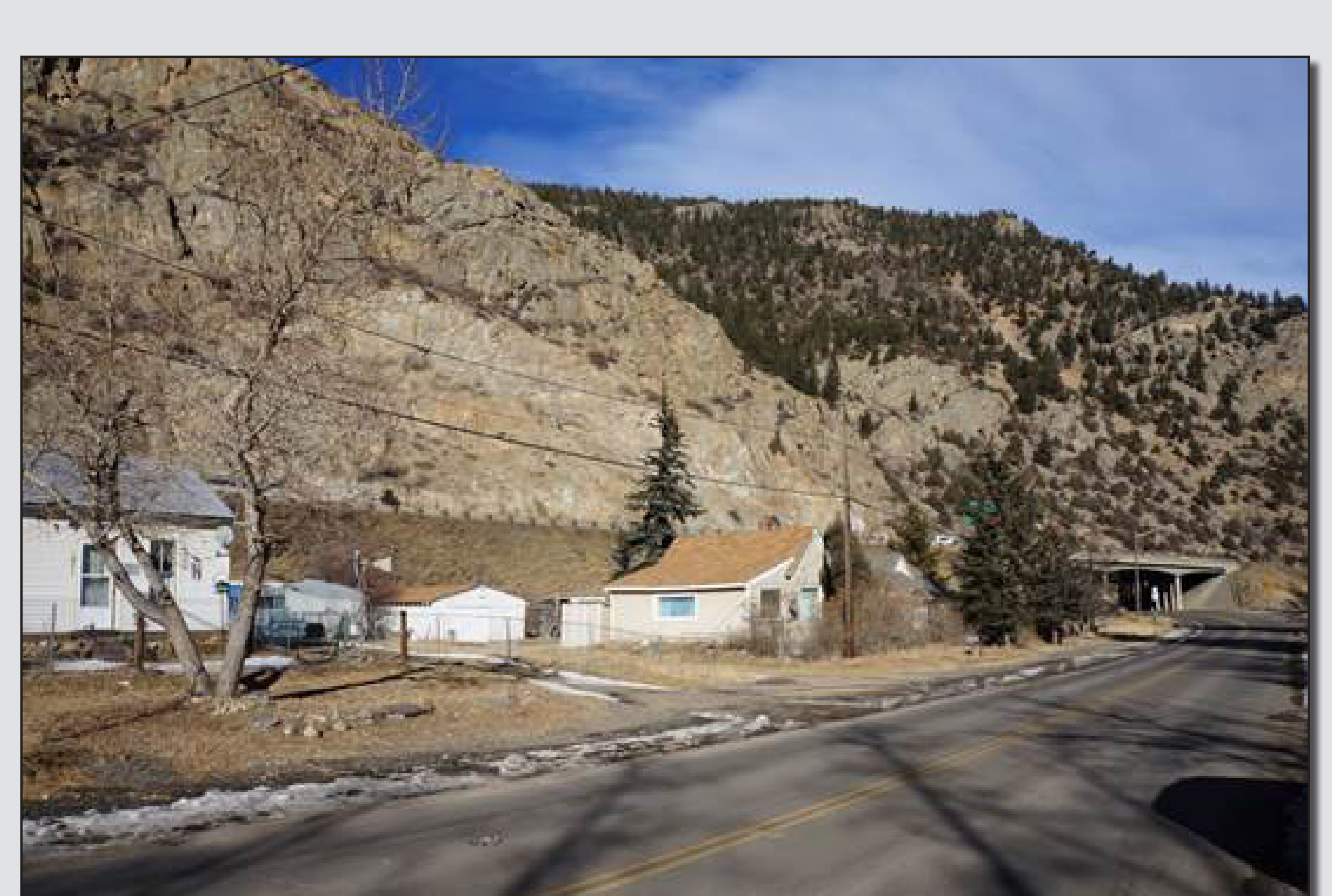
EXISTING VIEW: LAWSON