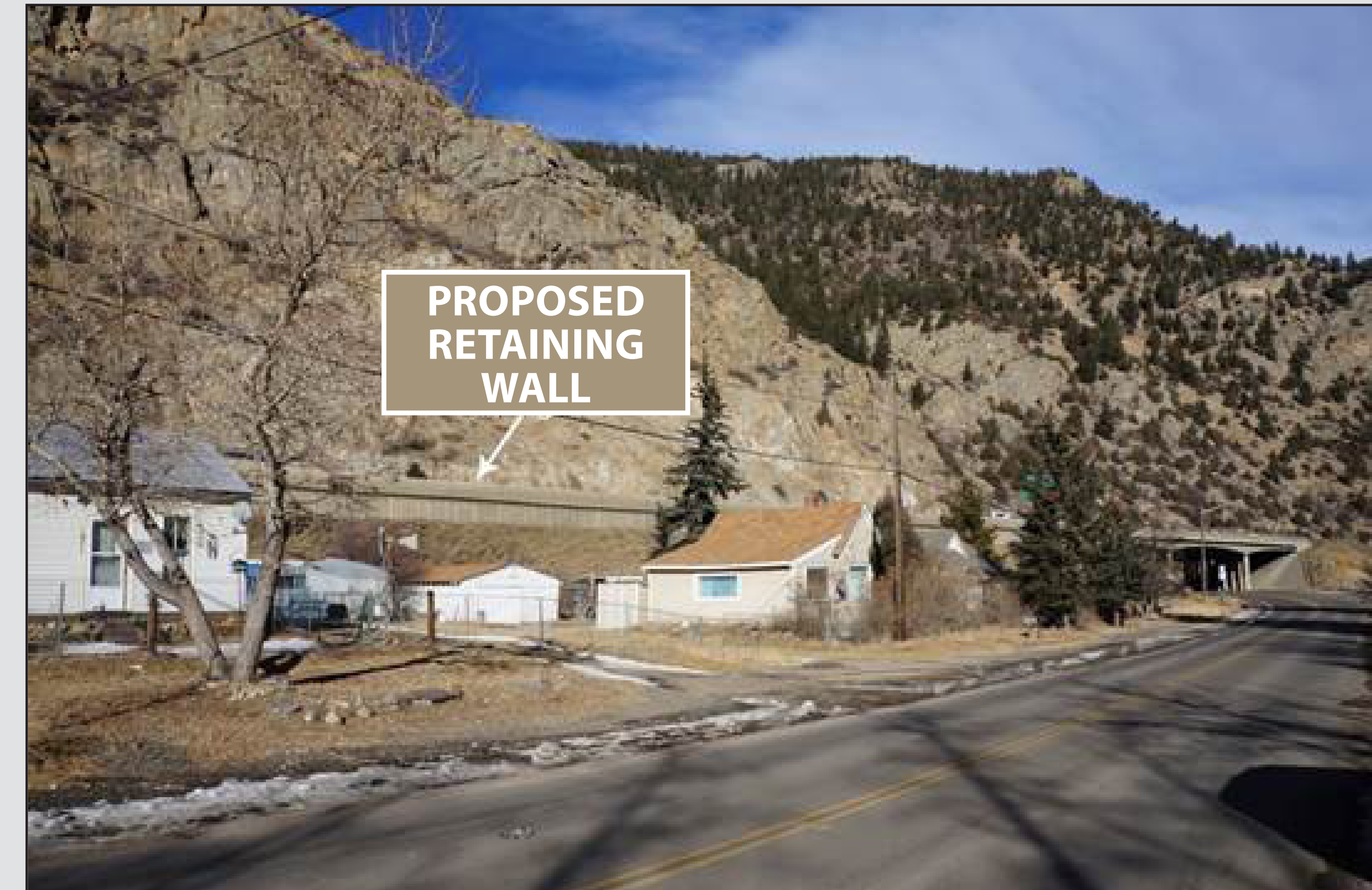
LAWSON: PROPOSED VIEW WITH RETAINING WALL